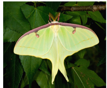
Luna moth, member of the giant silkworm moth family.