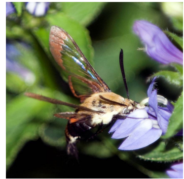
Hummingbird clearwing moth

Butterflies, moths, and skippers all require shelter and protection from inclement weather, which can be achieved in your garden by dense shrub plantings, old logs, or piles of brush. Food plants for all stages of Lepidoptera should also be protected from wind by a hedgerow, fence, or wall.