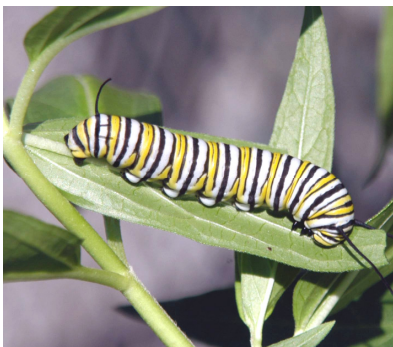
Caterpillars of the monarch butterfly survive only by eating milkweeds (Asclepias sp.)

Pollination is an important role played by butterflies, skippers and moths, but perhaps their more essential role is to serve as a food source for birds, bats, small mammals, and other predators both in their larval (caterpillar) and adult stages. Humans find special interest in the beautiful colors and delicate form of adult Lepidoptera—the collective name for butterflies, skippers and moths.