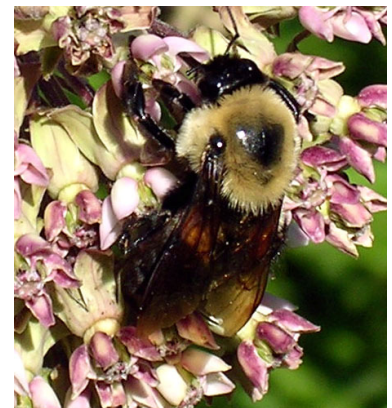
Native bee feasting on common milkweed (Asclepias syriaca)

Bees are guided to flowers by perfume and color, most significantly by ultraviolet colors not visible to humans. In your garden, you can attract these busy pollinators by providing yellow and purple/blue flowers, especially those with a sweet