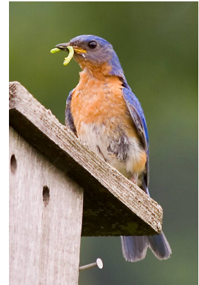
Eastern bluebird with a freshly caught caterpillar.

To provide optimal bird habitat in your landscape, include the various levels of vegetation found in their natural environment. Ground-dwelling birds appreciate shrubs, grasses and perennials for shelter; understory trees and canopy trees serve birds that nest in the middle and top layers of the forest. For many species of birds, evergreens provide important protection during storms and, for non-migratory species, throughout the winter months. Homemade or commercial bird houses provide additional lodging options for birds that dwell in tree cavities carved out by either a previous inhabitant or natural weathering processes.