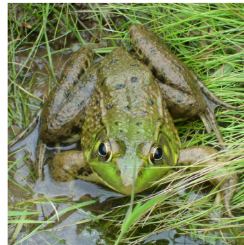
American bullfrog

Frogs and toads play important ecological roles as insect predators and as prey for larger wildlife. Besides insects, these amphibians also feast on slugs, snails and spiders. To provide habitat for toads and frogs, it is important to incorporate landscape features that offer them shelter as well as foraging ground; for example log piles, leaf litter, compost heaps, and groundcover plants. A homemade toad shelter is easy to construct from a broken terra cotta pot, turned on its side against the ground to form a snug, toad-sized cave.