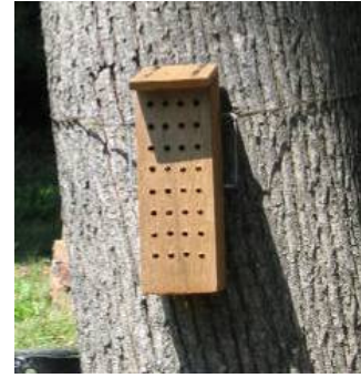
Native bee nesting box.

Unlike European honeybees, the majority of native bees are solitary, nesting in sunny spots on bare ground or in vacant holes in dead trees and old logs. You can provide artificial nesting boxes for the latter by taking a 4" x 4" x 8" block of wood and drilling holes of varying widths (3/32 – 3/8") about 3" deep and 3/4" apart. Alternatively, you can tie together a small bundle of hollow reeds, closed at one end and cut to varying lengths. Hang your bee nest on a tree, wall, or fence facing east or southeast to absorb warmth from the morning sunlight.