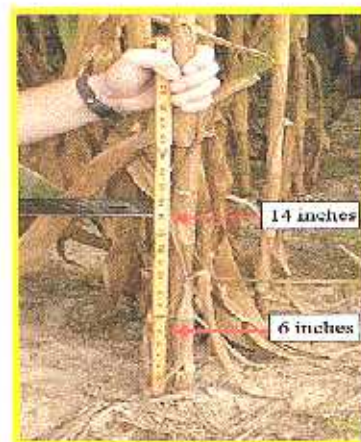
Figure 1. Collecting a corn stalk nitrate sample.

Corn stalk samples should be shipped immediately to a soil and plant testing laboratory that is familiar with this test. University of Delaware Cooperative Extension can assist in locating reliable testing laboratories. The stalk samples should be stored in paper bags, not plastic, to allow for some drying and to minimize the growth of mold. Samples that cannot be shipped to the testing lab within 24 hours should be refrigerated (not frozen) until shipping.