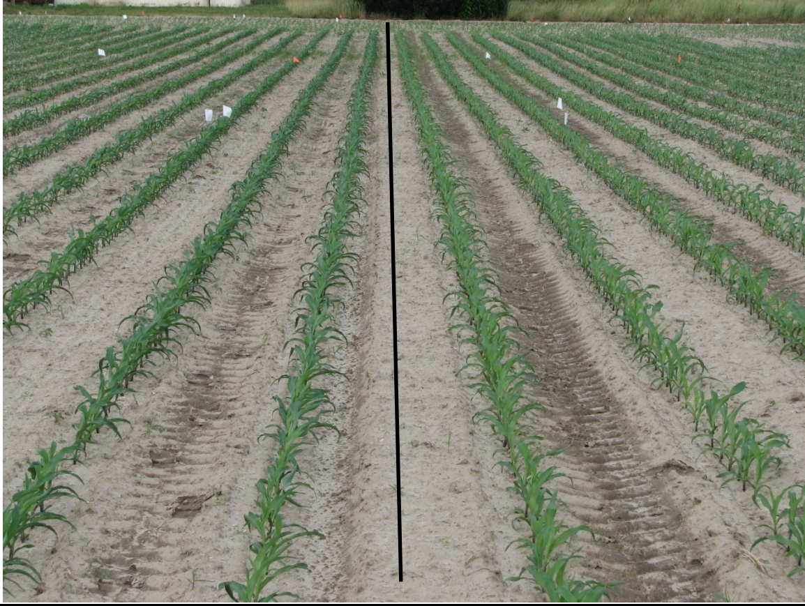
Figure 2. Site 3 on June 5. The four rows to the left of the black line are Treatment 6 (i.e., N + P starter with AVAIL and Nutrisphere-N), while the four rows to the right of the black line are Treatment 1 (no starter fertilizer; i.e., control). The four rows in Treatment 6 have a darker green color than the four rows in Treatment 1.