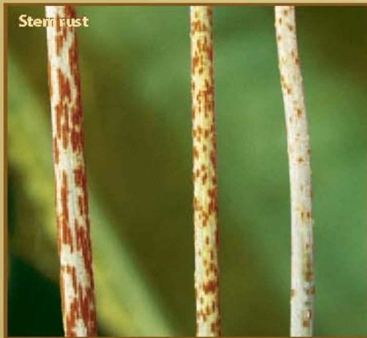
Figure 3. Examples of the variability in symptoms caused by stem rust (below), leaf rust (upper right) and stripe rust (lower right) as a result of unique interactions with wheat or barley varieties.

All three diseases have unique interactions with common varieties of wheat and barley. These interactions can modify the disease symptoms resulting in reduced lesion size and varying amounts of yellow or tan tissue surrounding the lesions (Figure 3). Becoming familiar with the range of possible symptoms for these diseases will improve the accuracy of the diagnosis and the management of these economically important diseases.