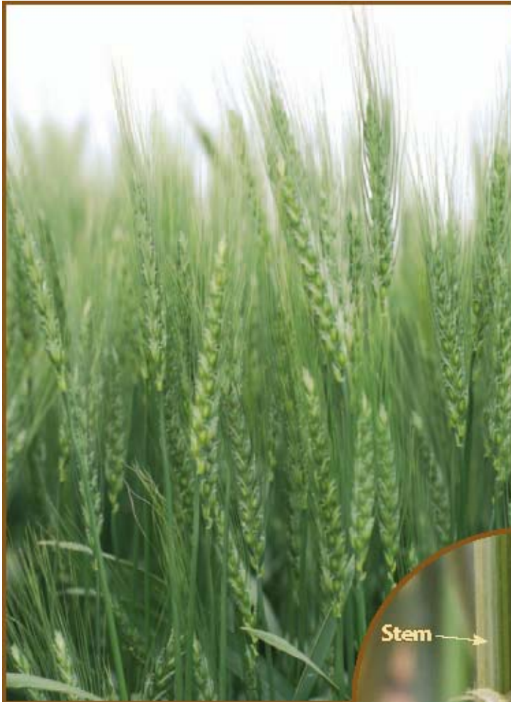
Figure 1. The diagnosis of rust diseases requires some basic understanding of plant anatomy and a quick review of this information may improve the accuracy of the identification process.

depends on host susceptibility and weather conditions, but the loss also is influenced by the timing and severity of disease outbreaks relative to crop growth stage. The greatest yield losses occur when one or more of these diseases occur before the heading stage of development. Early detection and proper identification are critical to in-season disease management and future variety selection.