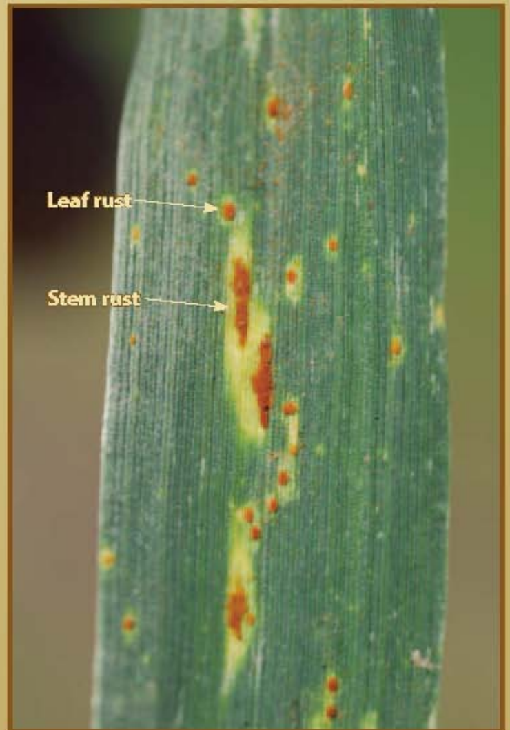
Figure 2. Comparison of the stem rust and leaf rust lesions on leaf tissue. Note the larger diamond shape of the stem rust relative to leaf rust.

Differentiating the rust diseases can be difficult, but with practice they can be reliably identified. Begin by considering broad characteristics such as which plant parts are affected (Figure 1) or arrangement of the blister-like lesions on plants. These characteristics will often separate one or more of these diseases quickly. Continue by examining less obvious characteristics including lesion size, shape, and color to either confirm the diagnosis or separate the more similar diseases. For example, stripe rust is the only one of these diseases to have the blister-like lesions organized into stripes on the leaves (left). If the lesions are scattered on the affected plant parts, both stem rust and leaf rust are a possibility and additional characteristics must be considered. Leaf rust typically causes small, round lesions on the leaf blades and leaf sheaths. In comparison, stem rust causes oval or elongated lesions and is capable of infecting nearly all aboveground parts of the plant, most notably the true stems (Figure 2).