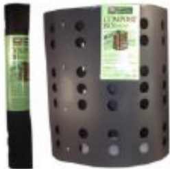
Compost Bins received through a partnership with Delaware Solid Waste Authority for our grant.

National 4-H Council and The Coca-Cola Foundation have awarded New Castle County 4-H with a REAL (Refresh the Environment with Action Leaders) 4-H! Community Grant.