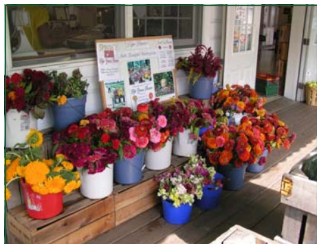
Fresh-cut flowers for sale at Fifer Orchards.