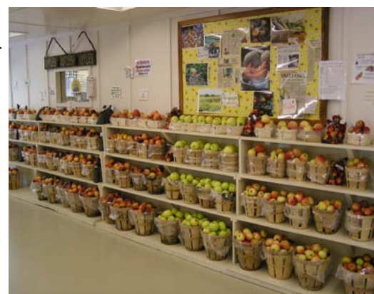
Freshly picked Fifer's peaches and apples.

Fifer Orchards is proud of their staff, as well as the thank you letters from visiting school groups, which are posted for customers to read. The Fifers are stewards of the land and are