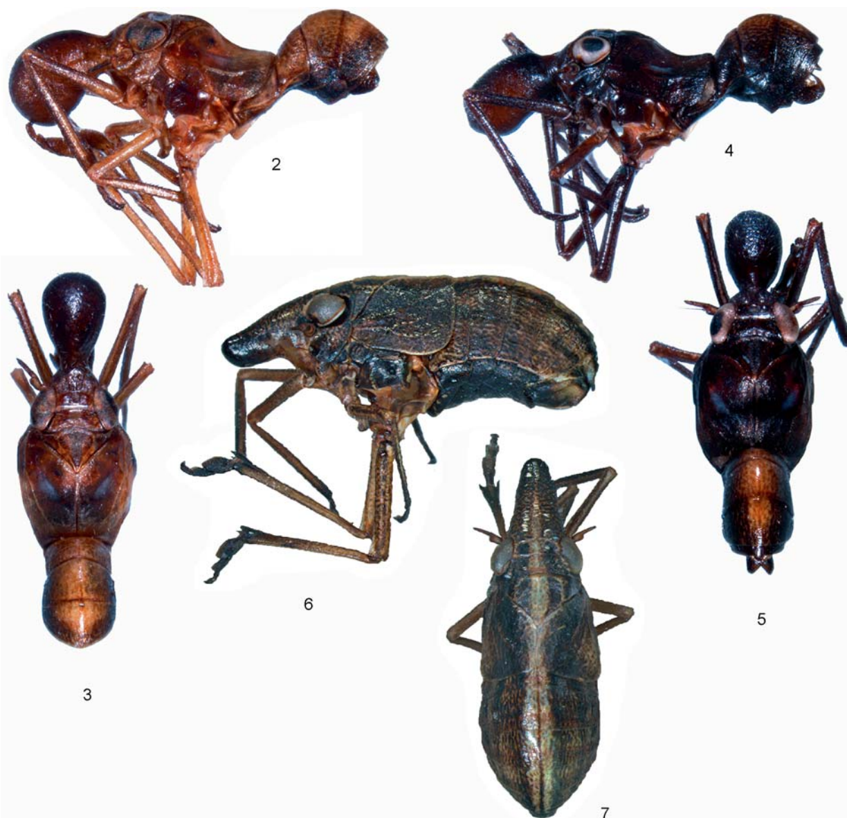
Figures 2–7. Formiscurra indicus gen. et sp. n.; 2, 4. Male, lateral view, 4.8–5.1 mm; 3, 5. Same, dorsal view; 6. Female, lateral view, 5.0 mm; 7. Same, dorsal view.